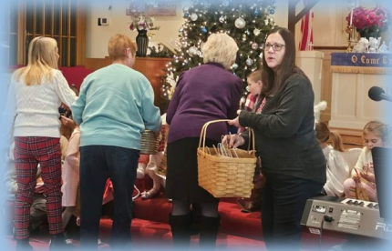
Gift Bags for the Kids