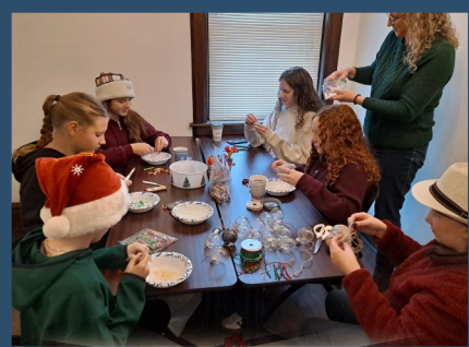
Youth Gift Exchange