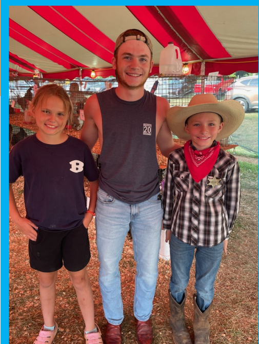
4TH OF JULY CELEBRATION IN THE PARK